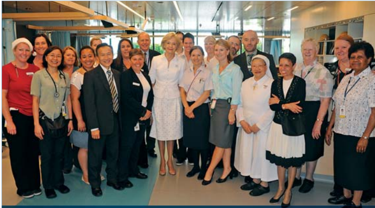
The multidisciplinary team offering holistic care at the Nelune Centre with Her Excellency Quentin Bryce AC