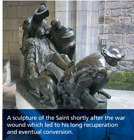
A sculpture of the Saint shortly after the war wound which led to his long recuperation and eventual conversion.

The last act was a mass conducted entirely in Euskara, the ancestral language of the Basque people and the mother tongue of St Ignatius.