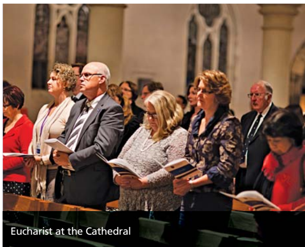
Eucharist at the Cathedral

Students of Mt St Michael's College performed a graceful liturgical dance at the Eucharist and the College choir filled the Cathedral with melodious singing. Delegates were entertained by the College musicians during the reception. Another College group performed a moving rendition of African and other songs during the conference.