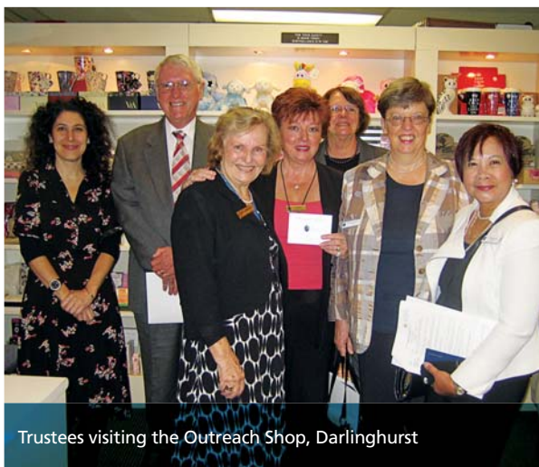
Trustees visiting the Outreach Shop, Darlinghurst