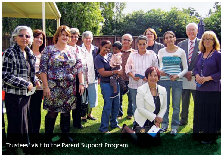
Trustees' visit to the Parent Support Program

The day concluded with a tour of St Joseph's Hospital and Village in Auburn after meeting with senior executives in the hospital boardroom. These visits affirmed the strong commitment and delivery of services to those in need, declared in the Sisters of Charity Outreach Mission Statement.