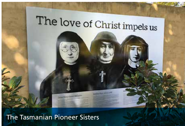
The Tasmanian Pioneer Sisters

A pilgrimage holds a special place in our Christian tradition. And to be a pilgrim impelled by Christ's love is central to Mary Aikenhead Ministries today. In October 2015, eleven pilgrims from our ministries across Queensland, New South Wales and Victoria gathered in Hobart for two days to retrace the steps of the Sisters of Charity who began their ministry in Tasmania in 1847. We were deeply touched by the stories of courage and love of the Sisters. They brought great comfort and practical assistance to those who suffered tremendous poverty and disadvantage, especially in the early years of the penal colony.