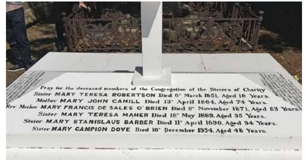
Cornelian Bay Cemetery

Our pilgrimage began by recalling the mission that was given by Mary Aikenhead in Ireland in 1838 to our first five Sisters. She sent them to love and serve people who were poor. At Hobart wharf we commemorated the arrival of the Sisters in Tasmania 1847. We then visited the Cascades Female Factory where the Sisters made daily visits between 1828 and 1856 to bring solace to thousands of women, most of whom were harshly punished while awaiting assignment to their colonial masters. Our journey continued to Cornelian Bay Cemetery to pray at the graveside of three of the first five Sisters of Charity in Australia. Our pilgrimage culminated in the heart of Hobart at St Joseph's Church.