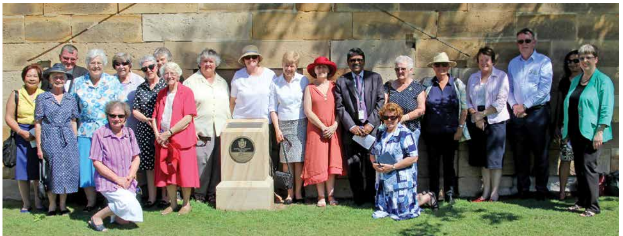
Attendees at the Parramatta Female Factory 175 year plaque ceremony