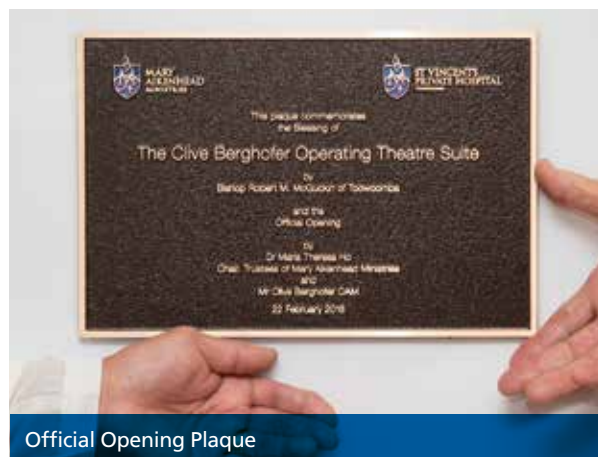
Official Opening Plaque

Diagnostic services will expand later in 2018 to include a full range of interventional services, delivered in partnership with HeartCare Partners.