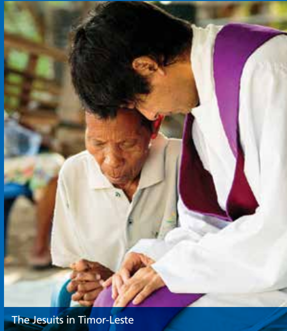
The Jesuits in Timor-Leste

The Inclusive Health Program (IHP) is a core activity for the Mission Directorate, St Vincent's Health Australia and is inspired by the teachings of Sr Mary Aikenhead rsc. While vulnerable people being cared for by SVHA facilities in Australia are the main focus of this program, the IHP is also committed to supporting overseas programs for vulnerable people.