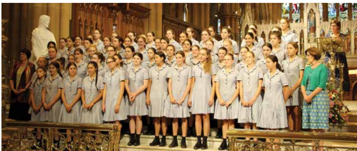
Year 12 St Vincent's College students at the Commencement Mass

Principal, St Vincent's College Potts Point