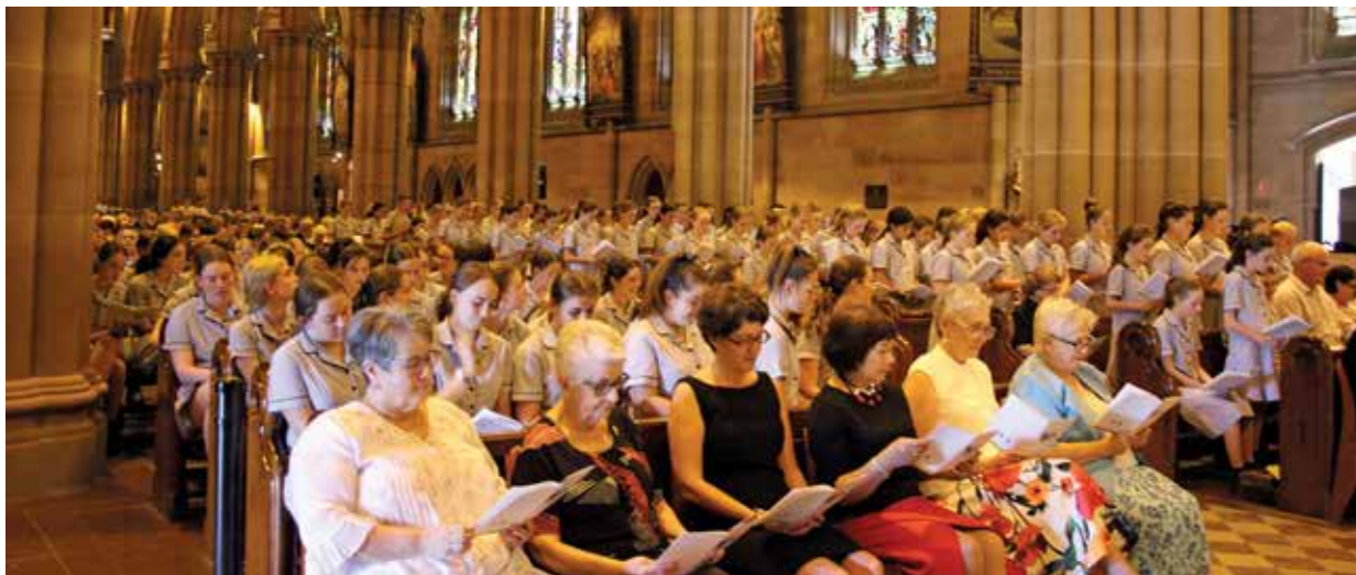
Commencement Mass at St Mary's Cathedral, Sydney

Throughout 2018, the St Vincent's College Community will celebrate its 160th Anniversary. Since 1858, a school has operated on the Potts Point site overlooking the Harbour Bridge and city. How different that vista is now compared to the early days of the College when sailing ships moored in Woolloomooloo Bay! Now the bay is home to the Australian Navy and the city skyline looms tall and illuminated. This is but one of the dramatic differences that can be illustrated in the 160 years since Foundation. The "different times" created from the profound changes in the Church Society and family; the political economy, technological changes, changes in demographics and democracy and the major advancement of women in every sphere of life have all impacted on St Vincent's College. Yet despite all the changes that the last 160 years have created, St Vincent's has stood confident and sure of itself.