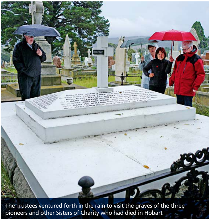
The Trustees ventured forth in the rain to visit the graves of the three pioneers and other Sisters of Charity who had died in Hobart

This year, the Trustees of Mary Aikenhead Ministries held their annual retreat in Hobart and on Friday, 28 – Sunday, 30 October went in the footsteps of the Sisters of Charity to significant places in Hobart where the Sisters had ministered.