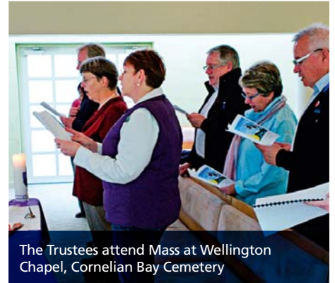
The Trustees attend Mass at Wellington Chapel, Cornelian Bay Cemetery