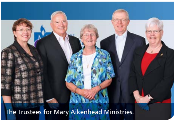
The Trustees for Mary Aikenhead Ministries.

The Inaugural Report: 1 July, 2009 – 31 December, 2010 , contains the Trustees' Sponsorship Report, and Mary Aikenhead Ministries' Financial and Ministry Oversight. Several appendices, which the Trustees think will be useful for the examination and discussion of the Report, have also been included.