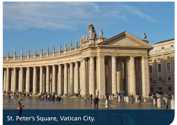
St. Peter's Square, Vatican City.