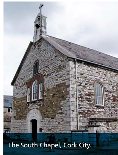
The South Chapel, Cork City.

Workshops and seminars, which will be conducted by Sisters of Charity based in Ireland, are a new element of this year's pilgrimage.