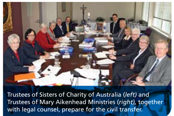
Trustees of Sisters of Charity of Australia (left) and Trustees of Mary Aikenhead Ministries (right), together with legal counsel, prepare for the civil transfer.