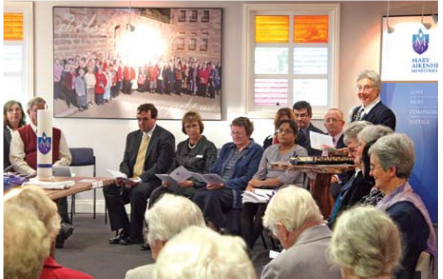
Brisbane Ceremony, hosted by Mt St Michael's College, Ashgrove.