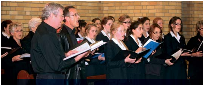
Combined Choir, St Vincent's Hospital and St Vincent's College.

CARDINAL PELL (FROM THE PRAYERS OF INTERCESSION)