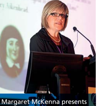
The Foundation Documents.